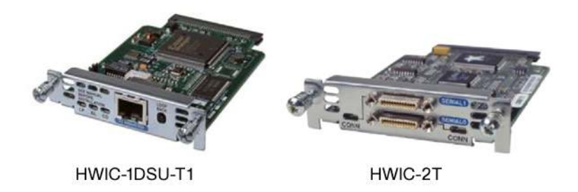
Figure 1. Cisco 1- and 2-Port Serial and Asynchronous HWICs