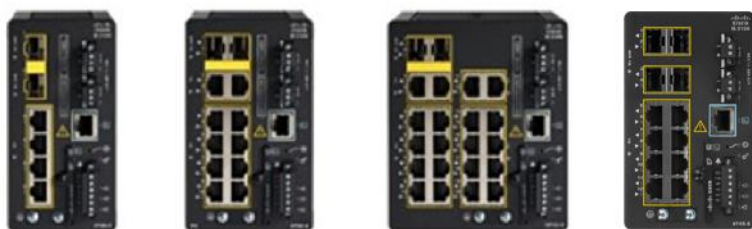
Figure 1. IE-3100 Rugged Series switches models