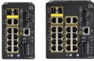
Figure 2. IE-3105 Rugged Series switch models with enhanced feature set