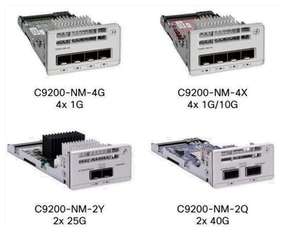
Figure 2. Cisco Catalyst 9200 Series Switch network modules

Cisco Catalyst 9200 Series switches come with modular or fixed uplinks as indicated in Table 1. With modular SKUs, the field-replaceable network modules provide infrastructure investment protection by allowing a nondisruptive migration from 1G to 10G and beyond. When you purchase the switch, you can choose from the network modules described in Table 3.